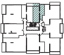
11TH - 23RD FLR KEY PLAN