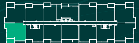
TYPICAL FLOOR (4-8)